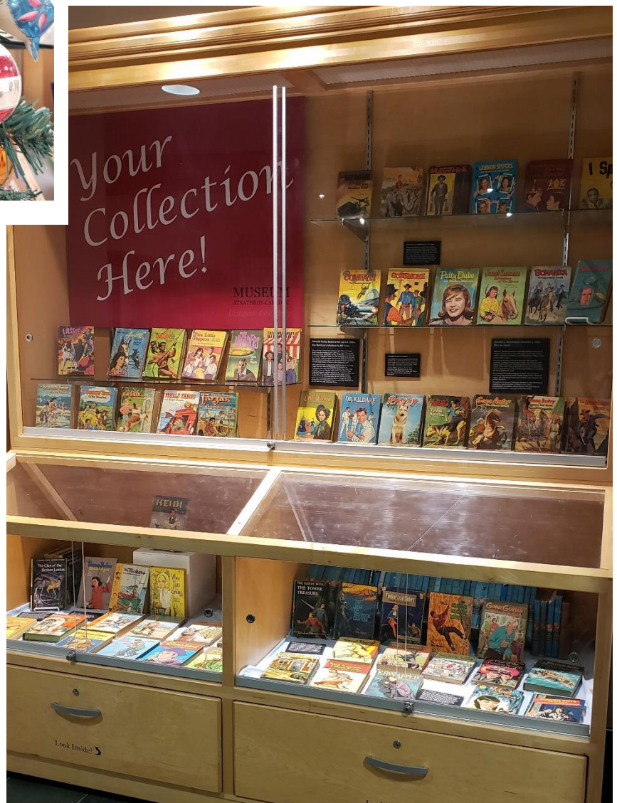
Image: Vintage Young Adult Books Bill Groot Community Corner Display

Image: Antique Ornaments, Darlene Loyst Community Corner Display