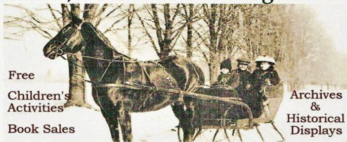
Photo Source: London Township Bi-centennial Collection – Foster family on Fanshawe Park Road c.1914 www.middlesexcentrearchive.ca

Learn about Middlesex County heritage with local historians, historical societies, museums, archives & other organizations.