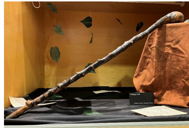
The Walking Stick